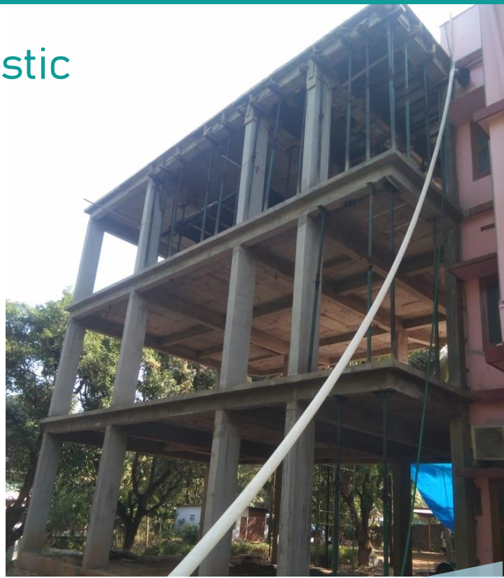
Construction of Minor OT Room and CSSD

Dharmagiri St. Joseph's Holistic Healing Centre has been a care giver in Palakkad and they were in need of a Minor OT room. We had partnered with them earlier too and with the inauguration of this facility, it is assumed that at least 500 people would benefit annually.